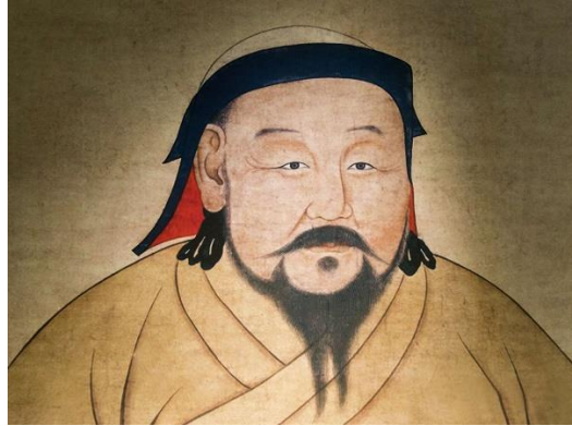
Portrait of Khubilai Khan

Khubilai's victory marked the shift of the centre of power of Mongol rule from the northern steppe, as represented by Karakorum, southward to northern China. It also strengthened the hands of those who were in favour of making changes in the Mongol ancestral traditions by adopting certain Han institutions to facilitate Mongol rule in north China. In 1271, Khubilai adopted a Han Chinese dynastic name, Yuan, meaning first. The Chinese accepted the legitimacy of the Mongol-ruled Yuan dynasty, and its history formed a part of the official historical chronicles of China. In 1272, Khubilai sited his capital at Yanjing (Beijing), where a new imperial quarter had been built. A rebellion by a hereditary Han military aristocrat led to Khubilai stripping all such aristocrats of military power. He reorganized the government administrative system with reference to the models provided by the Jin and earlier Chinese dynasties.