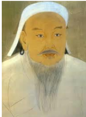
Portrait of Chinggis Khan (in the National Palace Museum, Taiwan)

As the number of his followers grew following the military victory, Chinggis decided to move away from his mentor and ally and set up his own camp. Many Qiyān relatives and notable members from his father and mother's clan came to join him, and together they recreated a tribal alliance of Qiyān clan members. In 1189, the aristocratic members of the tribal alliance met to elect the twenty-seven-year-old Chinggis as their leader. At this point Chinggis demonstrated his considerable ability for systematic organization, by appointing officers to take charge of various functions and roles vital to the operation and maintenance of his army. The appointees were all people with whom he had a special personal bond. They, and the newly established corps of personal guards, were his most trusted and loyal servants. These measures, calculated to strengthen the effectiveness of his military organization, also enhanced his own power.