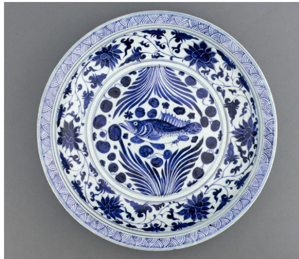
Yuan dynasty porcelain dish, mid-fourteenth century.

This social order, which was created and upheld by the Mongols, was designed to serve their interest as the ruling elites. It favoured themselves and their foreign helpers, whom they relied upon for experience and skills in areas such as governing sedentary populations and managing a complex economy, which were not indigenous to the Mongols. These few foreigners did not constitute a threat to the Mongol rulers. The ethnic classifications and gradations were the Mongols' method to preserve and fix their privileged position permanently, with themselves at the top and with the Chinese majority at the base of the social pyramid. Their other tactic for holding society at the existing status quo was to register people (households) in hereditary occupational categories, such as soldiers, farmers, artisans, Buddhist monks, astrologers, miners, Confucian scholars and so on. Members of some of these groups were obliged to give one month's service annually, free to the state, as corvee (a labour service tax).