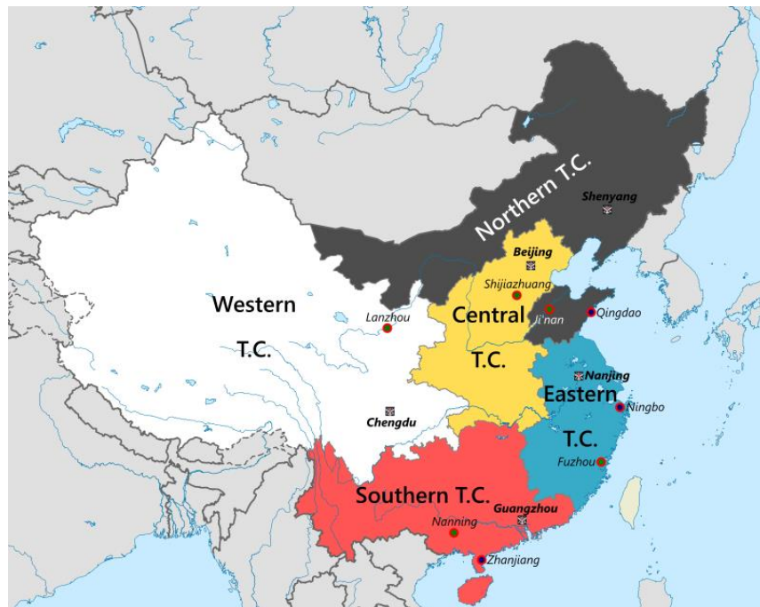
The six Theatre Commands set up in 1949.

Having seized power in China by force, the CCP feared internal subversion, and possible invasion by the Nationalist forces who had retreated to Taiwan and Burma. In order to guard against these dangers, the new regime promptly divided China into six temporary military regions (“Theatre Commands”), to be administered by the top PLA generals.