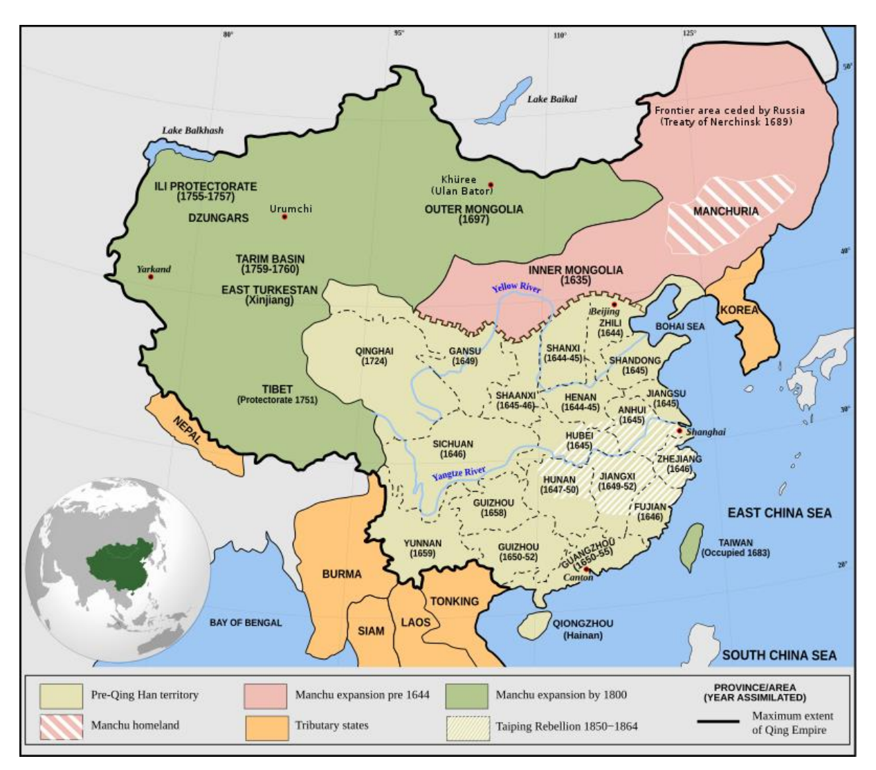
Map of the Qing Empire and adjoining lands (Wikipedia: retrieved on 30 November 2023 from

Despite the brutality of the original conquest, the alleviation of tax burdens and economic growth under the